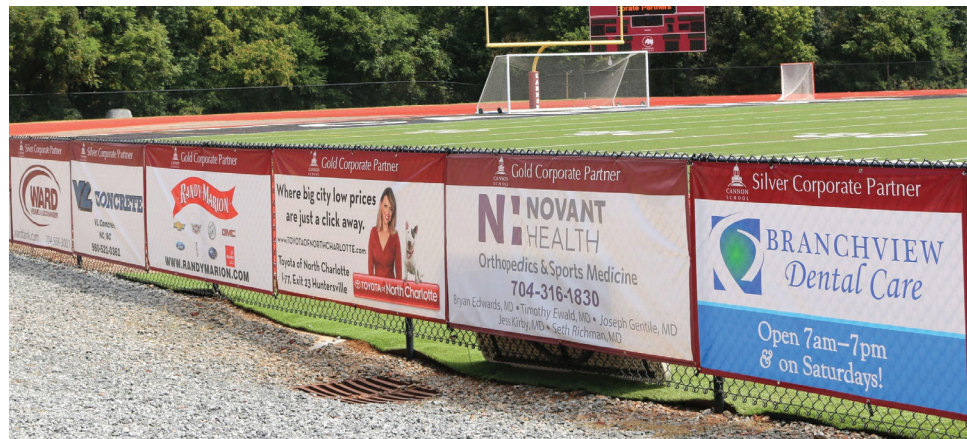
Stadium field banners