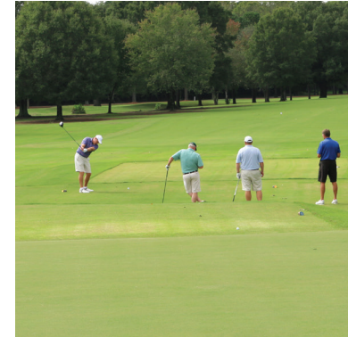
Annual PAC Golf Tournament