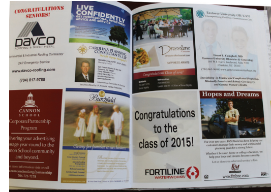
Ads in the yearbook, athletic programs, and on the CPAC monitors