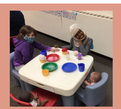
LEARN AND PRACTICE SOCIAL SKILLS