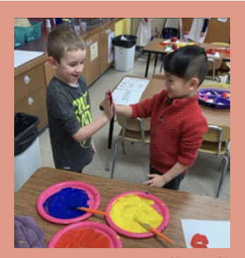
ART AND SENSORY PLAY