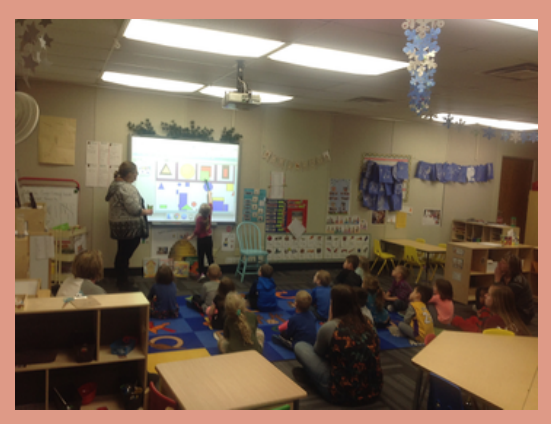
LARGE & SMALL GROUP LEARNING