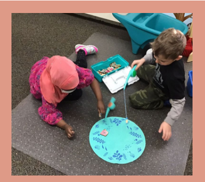
PLAYING TO LEARN AND LEARNING TO PLAY