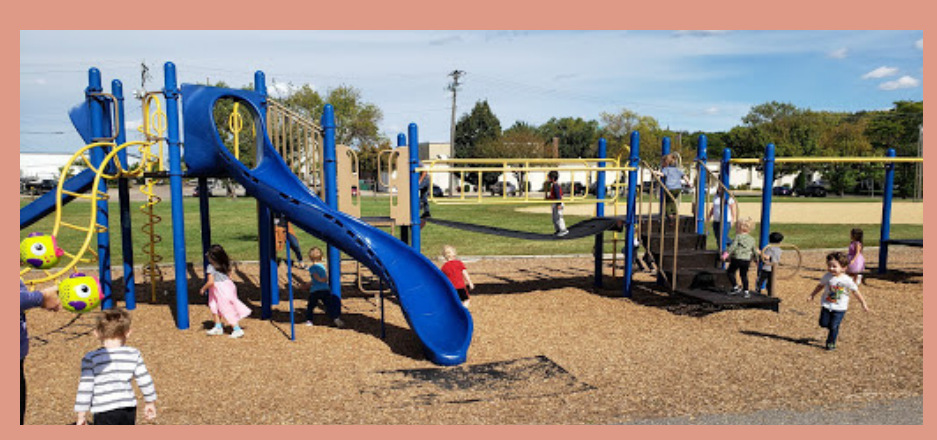
MOVING OUR BODIES TO LEARN AND GROW