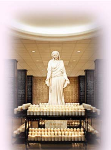
Basilica of the National Shrine of the Immaculate Conception in Washington D.C.