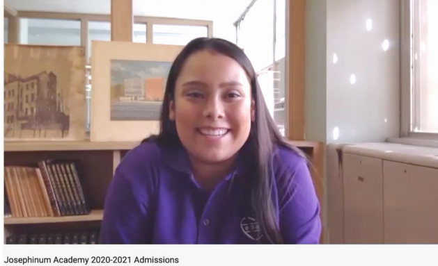
Josephinum Academy 2020-2021 Admissions