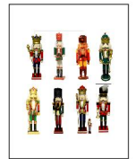
"Nutcracker Examples" page

*Supply set-up for right-hand artist. Switch for left-handed artists.