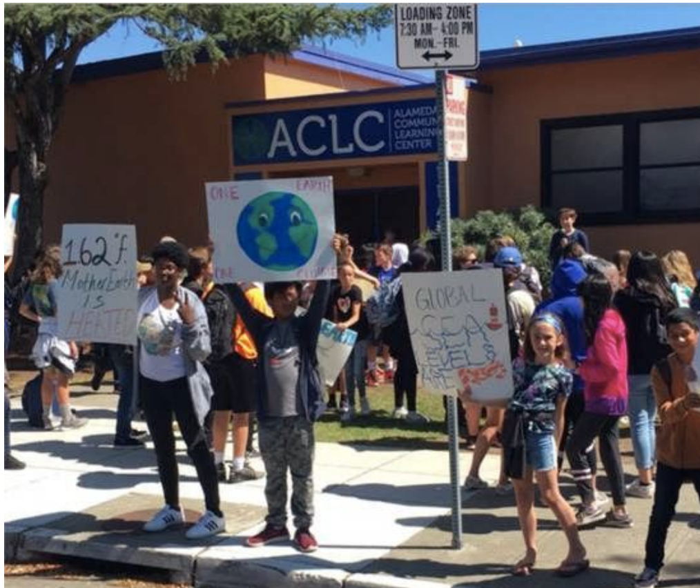
Learners sharing their thoughts (and signs) with passers-by on Third Street

Two of our senior learners took the lead in planning a rally and informational session for the Climate Day of Action a few weeks ago. Our learners either continued with their day as normal or participated in the rally at the front of our school. I was proud to see our learners take action for something they believe in, and pledge to do my best to keep our learners safe in situations like this, regardless of their beliefs or stance.