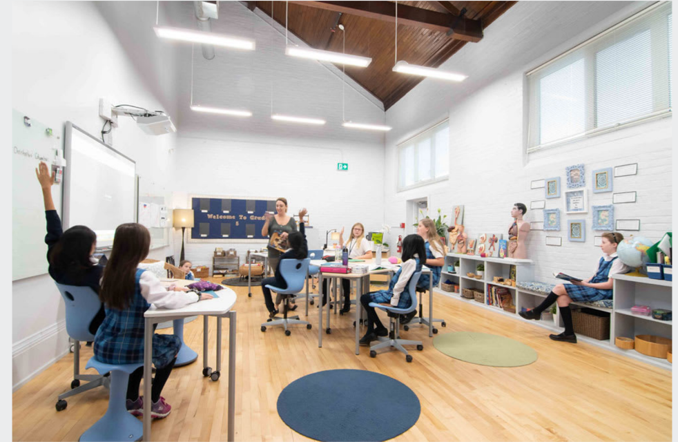
Science classroom at Trafalgar Castle School