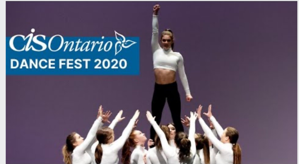
CIS Ontario Dance Fest 2020