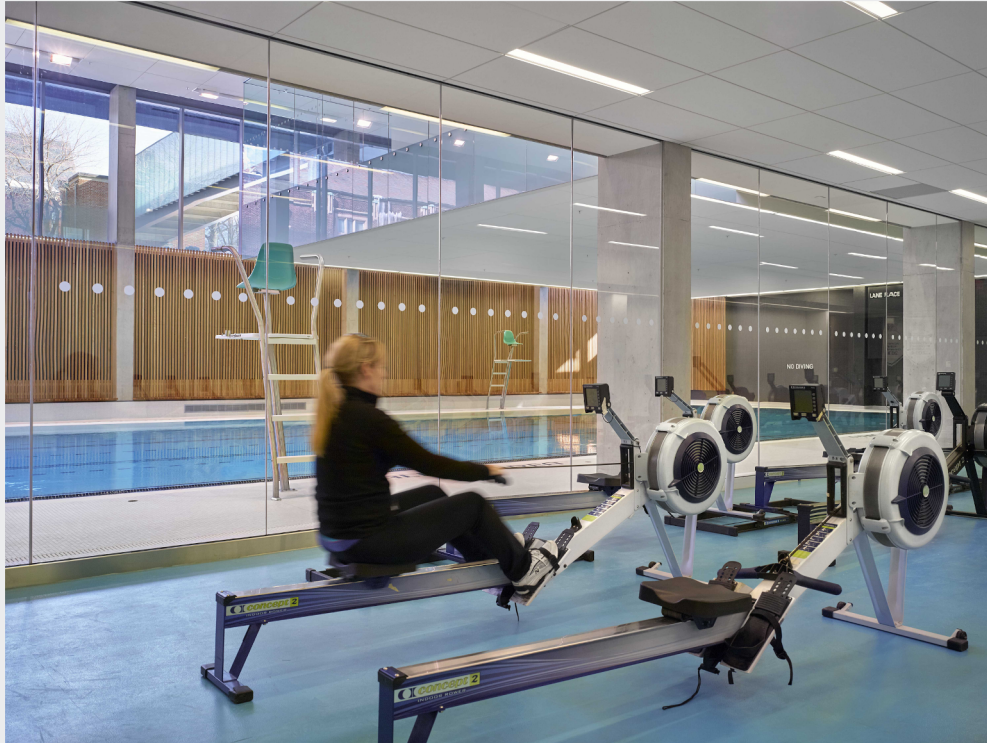
Athletic and Wellness Centre at Branksome Hall