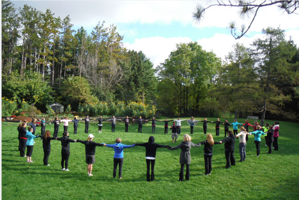
CIS Ontario Experiential Educators' Network at Norval Outdoor School