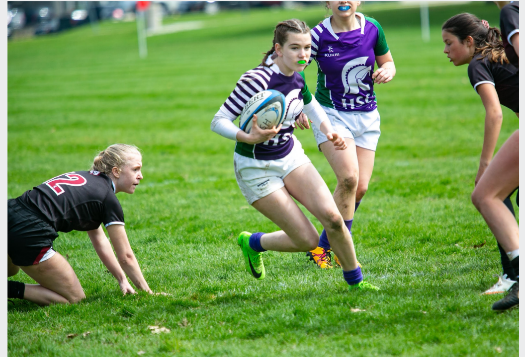
Rugby at Hillfield Strathallan College