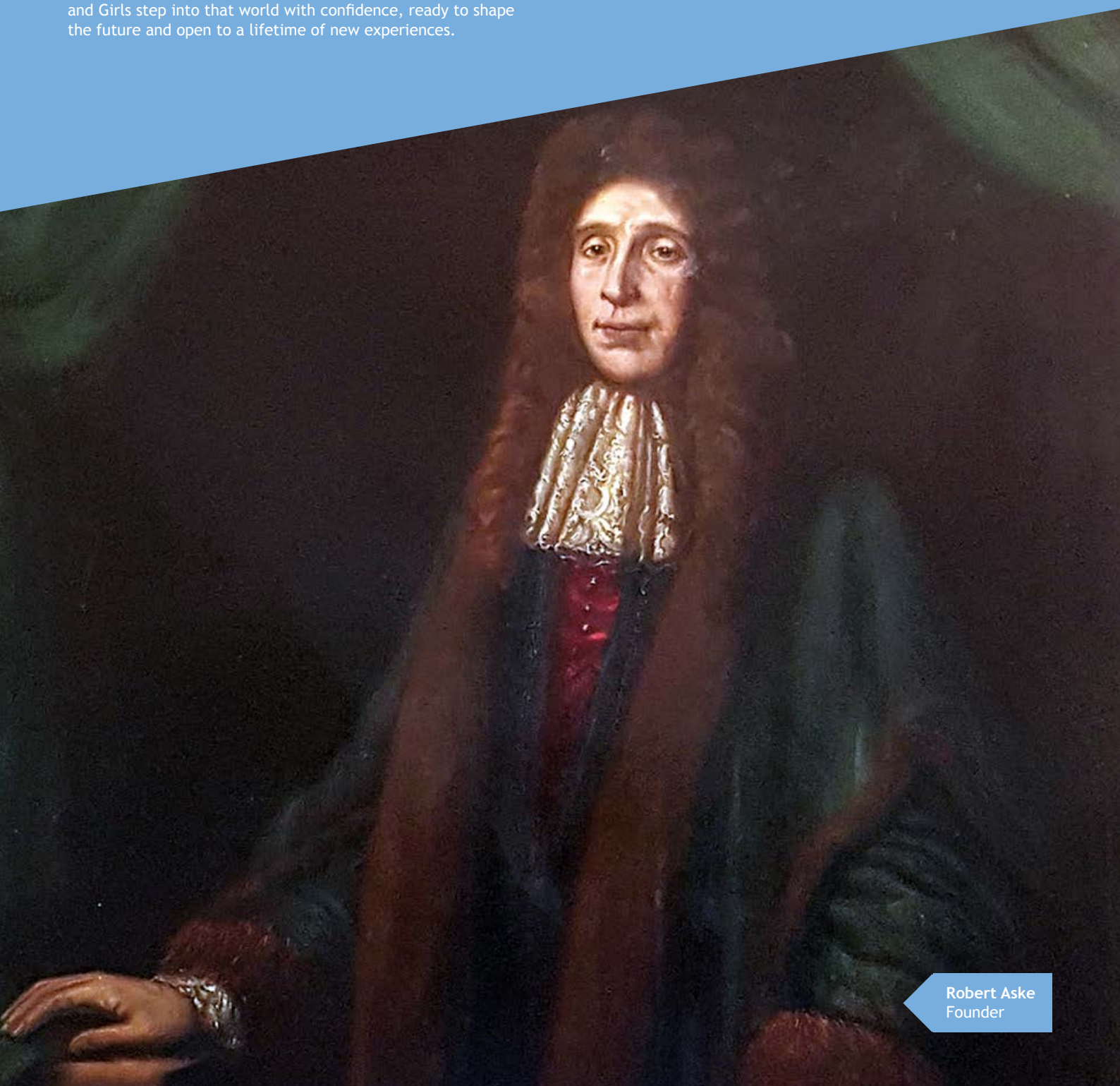
Robert Aske Founder

We work together, offering the best of single-sex education in a co-educational environment. Habs will always be the best place to learn and the best place to teach and work. When you join the Habs family, you will be part of our community long after your schooldays are over.