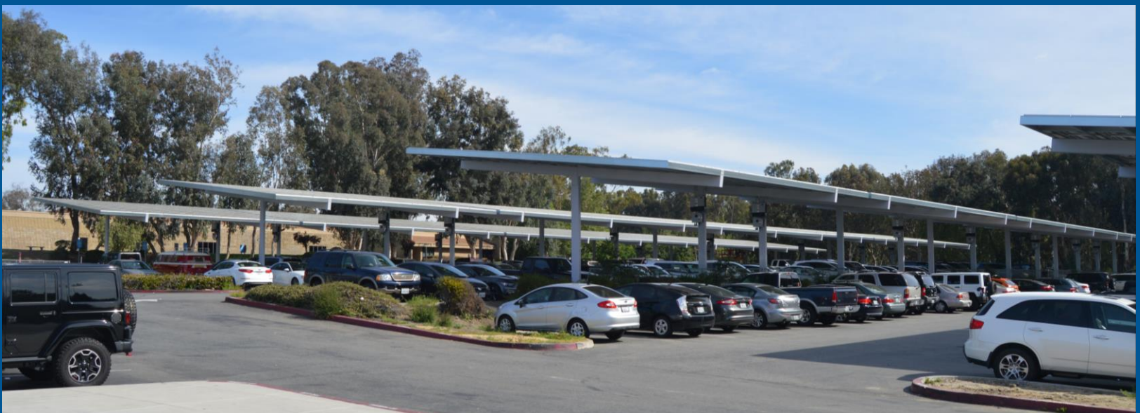
Example of a Parking Canopy