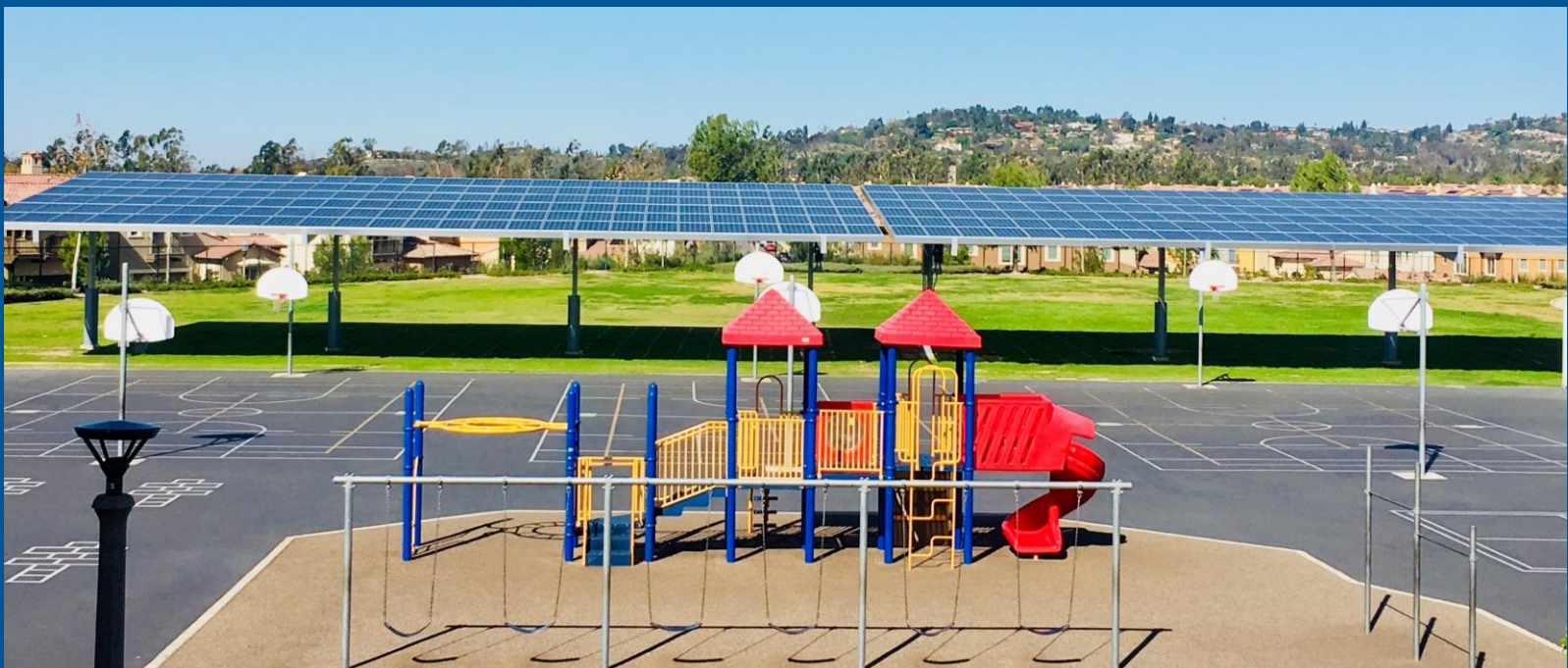
Example of an Elevated Structure