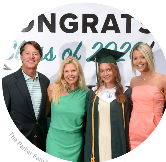
The Parker Family, 2020 Baccalaureate Event