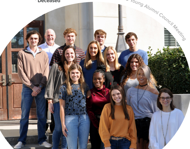
2019 Young Alumni Council Meeting