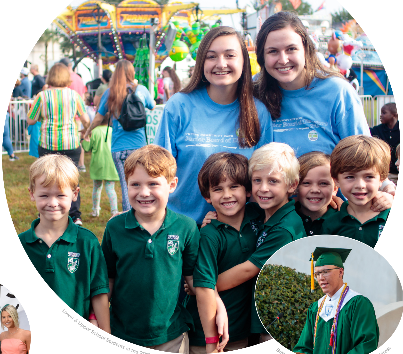
Lower & Upper School Students at the 2019 Brunswick Fair