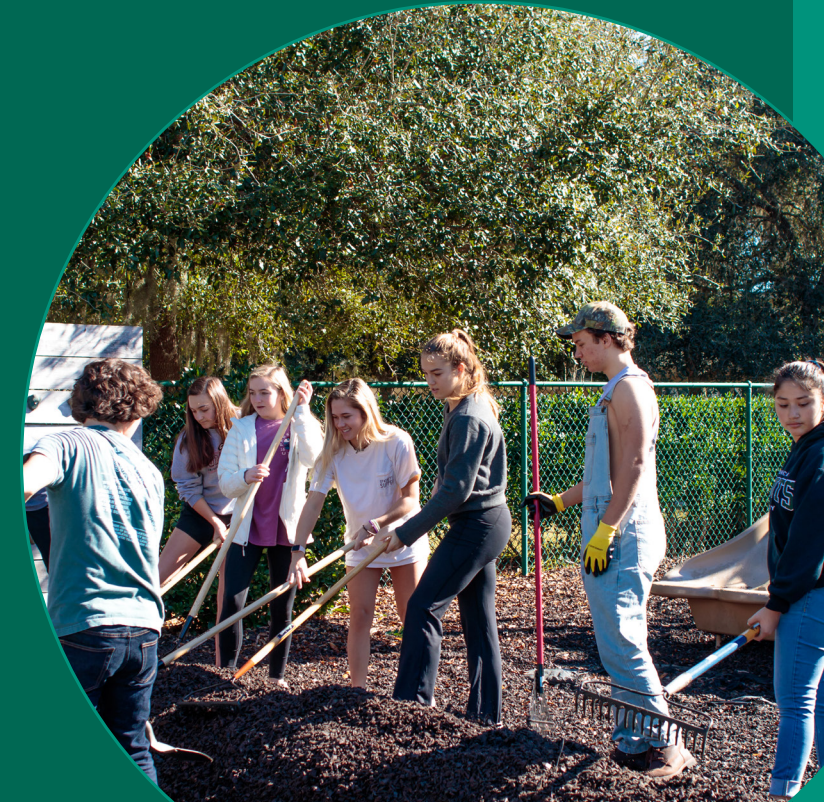
FA Upper School Students, 2020 Hands on Frederica

On January 25, 2020, students, faculty, staff, trustees, grandparents, and friends of the school joined for a day of service on campus to prepare for the upcoming Open House Week. For this fourth installment of Hands on Frederica Day, volunteers arrived on campus with positive attitudes, wide smiles, tools in hand, and prepared to offer their time and talent for the betterment of FA. Over the course of four hours, they tackled projects ranging from painting the Hamilton Hall stage, to leveling mulch on the Terry Thomas Playground, to washing the fleet of FA buses, and everything in between.