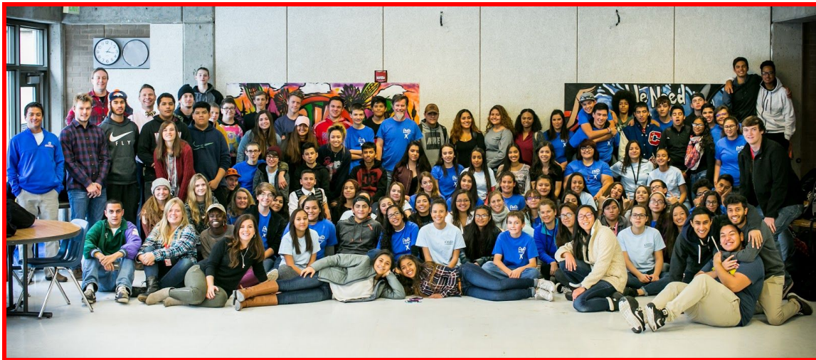
CHS AVID program and CU Coaches