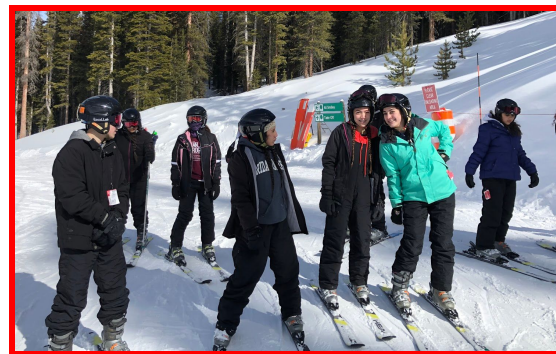
Annual AVID Ski Trip