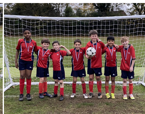
Runners-Up - Bayern Munich