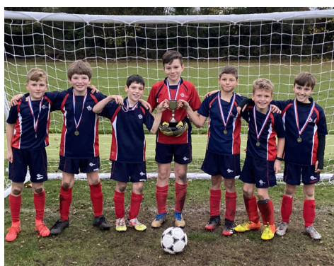
Winners - Tottenham

Real Madrid 0 Liverpool 2 Bayern Munich 1 Tottenham 0 Silverbacks 0 Panthers FC 1 Wolves 4 Cheetah FC 1