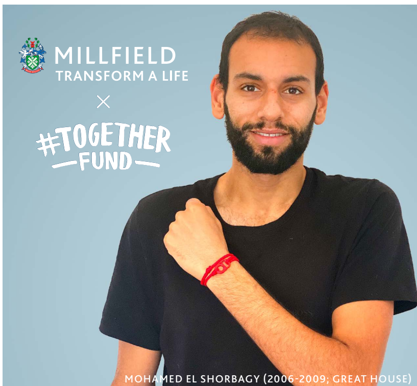
MOHAMED EL SHORBAGY (2006-2009; GREAT HOUSE)

To show how valuable your continued support is, here are five recent leavers who have all benefitted from scholarship opportunities at Millfield. Thank you for donating and please stay in touch.