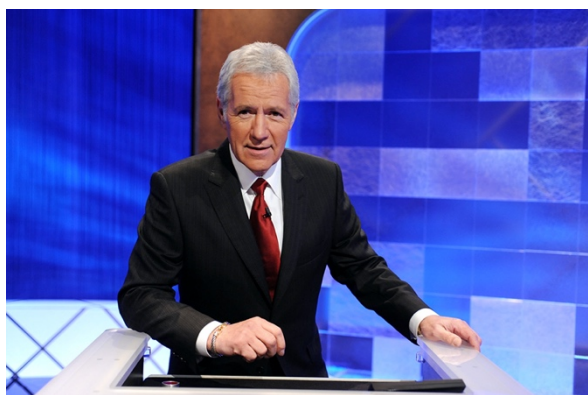
Alex Trebek on Jeopardy!

On the morning of November 8, 2020, long-term host for the game show 'Jeopardy!' Alex Trebek passed away. The cause of death has not yet been revealed, but in 2019, Trebek revealed that he was diagnosed with stage 4 pancreatic cancer. According to CNN, "Jeopardy! is saddened to share that Alex Trebek passed away peacefully this morning surrounded by family and friends," said a statement shared on the show's Twitter account on Sunday. "Thank you Alex." Despite being in the game-show business for over 5 decades, Alex was originally a reporter for the Canadian Broadcasting Corp. He initially hosted "Reach for the Top" and "Jackpot" after switching from journalism to hosting game shows in 1966. He joined "Jeopardy!" in 1984 and has been with the show since.