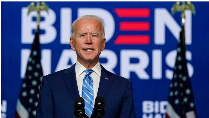
Biden, after beating Trump, elected 46th president of the United States.

The president Donald Trump has launched a number of legal challenges over ballot counting in key battleground states, with his campaign filing suits in Pennsylvania, Georgia, Michigan and Nevada as the states continue to tally ballots sent by mail. Fox News stated, but in a statement Saturday, Trump did not concede and instead vowed to continue to fight. "The simple fact is this election is far from over. Joe Biden has not been certified as the winner of any states, let alone any of the highly contested states headed for mandatory recounts, or states where our campaign has valid and legitimate legal challenges that could determine the ultimate victor," the president said.