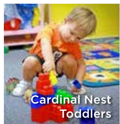
Cardinal Nest Toddlers