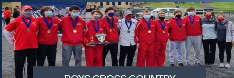
BOYS CROSS COUNTRY