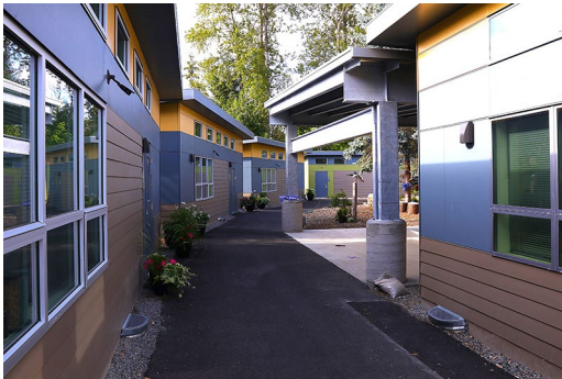
Clara Barton Elementary

students. The student-centered design incorporates features that conserve natural resources and reduce energy costs. The school is named after Clara Barton, who was a teacher before she founded the American Red Cross.