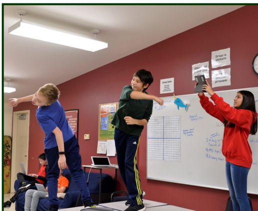
Above: Film Making rehearses a fight scene

At the end of the week, other classes came to their showcase to see the two movies the Film Making group made, learn about how to be an activist, see the model train set in action, and taste unusual foods.