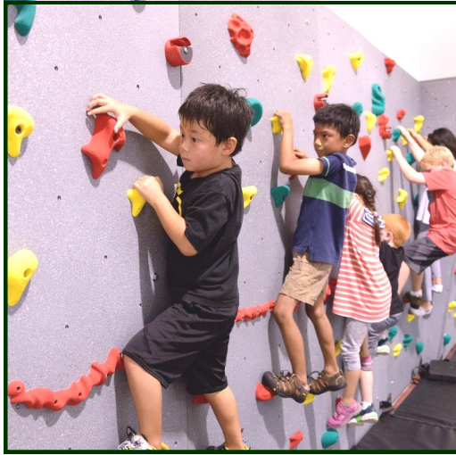
The inaugural climb on our new Tommy Yan Adventure Wall