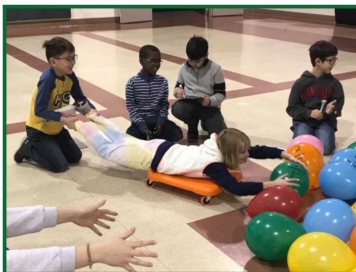
Below: Practicing fractions with Hungry, Hungry Hippos

THIS NEWSLETTER IS IN COLOR BY EMAIL & ON OUR WEBSITE!