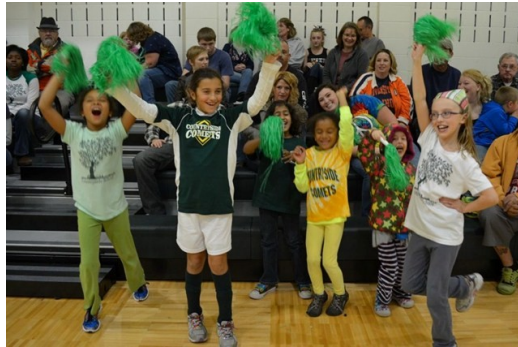
Cheering fans at the 1st game in the new gym!

ALUMS & ALUM PARENTS: SHARE YOUR E-MAIL ADDRESS WITH US!