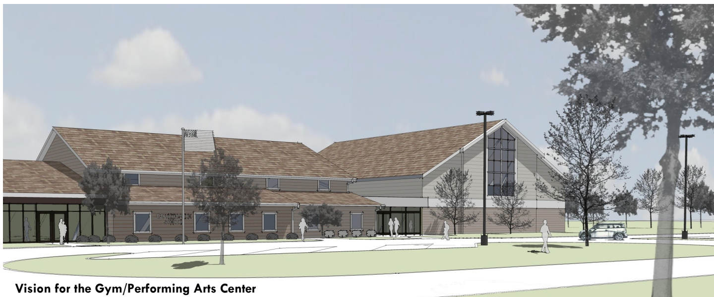
Vision for the Gym/Performing Arts Center