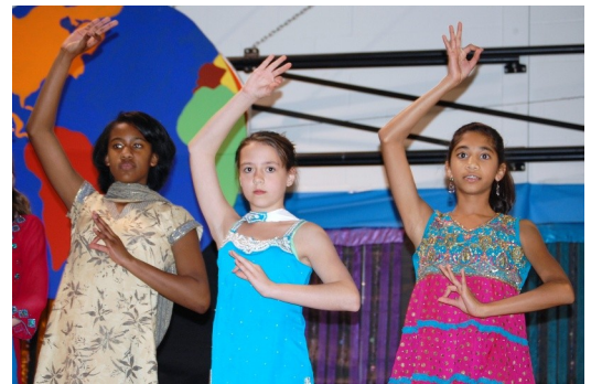
Global Playground: Bollywood dance - middle school girls

The All-School Music Show was Global Playground and included songs and dances from around the world. It was accompanied by an All-School Art Show.