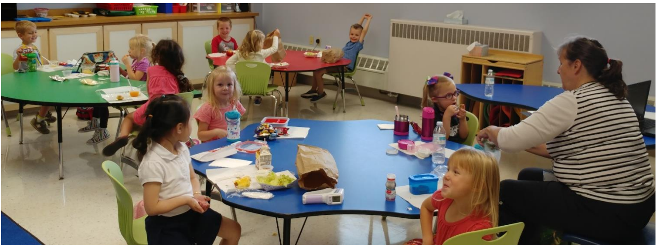
Making new friends during lunch time!

A, B, C all the way to X, Y, Z Look at our Xavier scholars!!