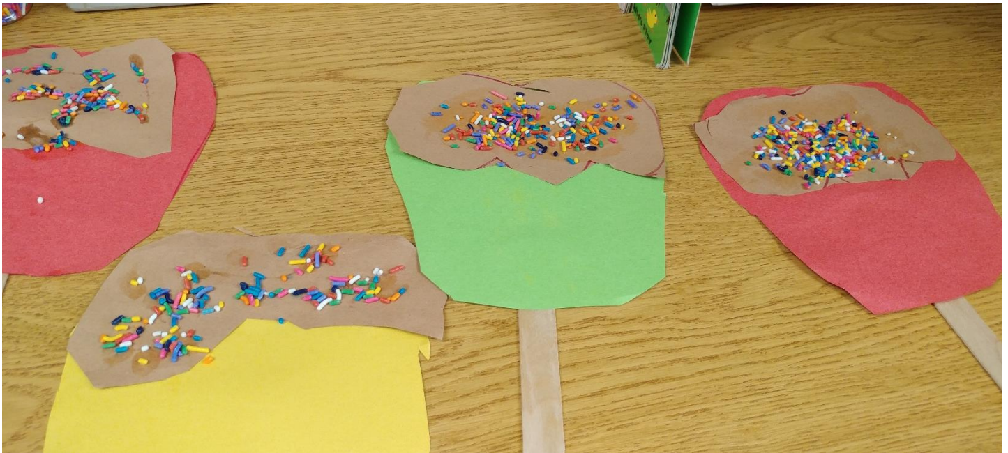
Candy Apples with sprinkles, yummy!