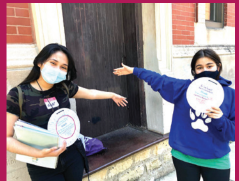
Freshwomen make new friends and show off awards

Despite the fact that the girls had been out of school for a long time, they showed up with a positive attitude ready to tackle each day. Their willingness to participate, be flexible and follow the safety guidelines was exemplary. We are looking forward to their accomplishments this school year - working hard, making lots of friends, building strong relationships with their teachers, and participating in class and beyond.