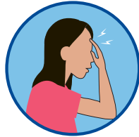
Headache that is unusual or long-lasting