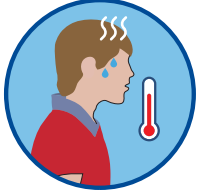
Fever > 37.8°C