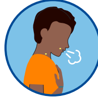
Difficulty breathing or shortness of breath