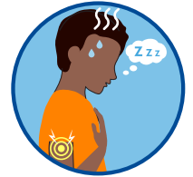
Muscle aches or extreme tiredness that is unusual