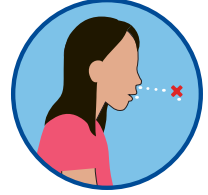
Decrease or loss of taste or smell