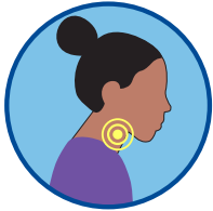
Sore throat, painful swallowing