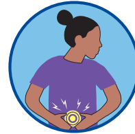
Nausea, vomiting, diarrhea