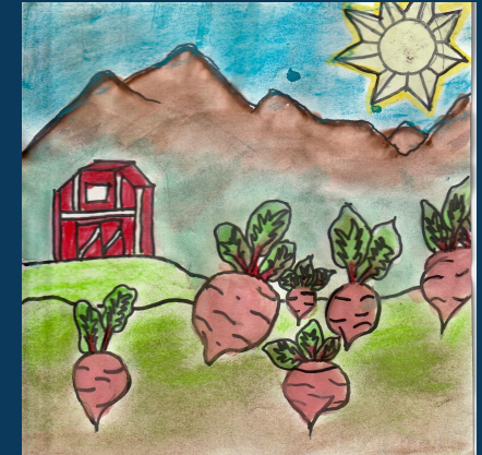
Artwork by Columbine Elementary School student