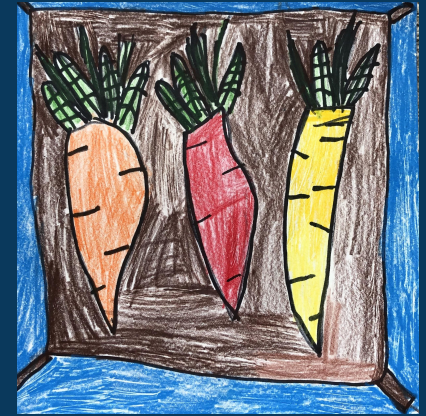
Artwork by Pioneer Elementary School student