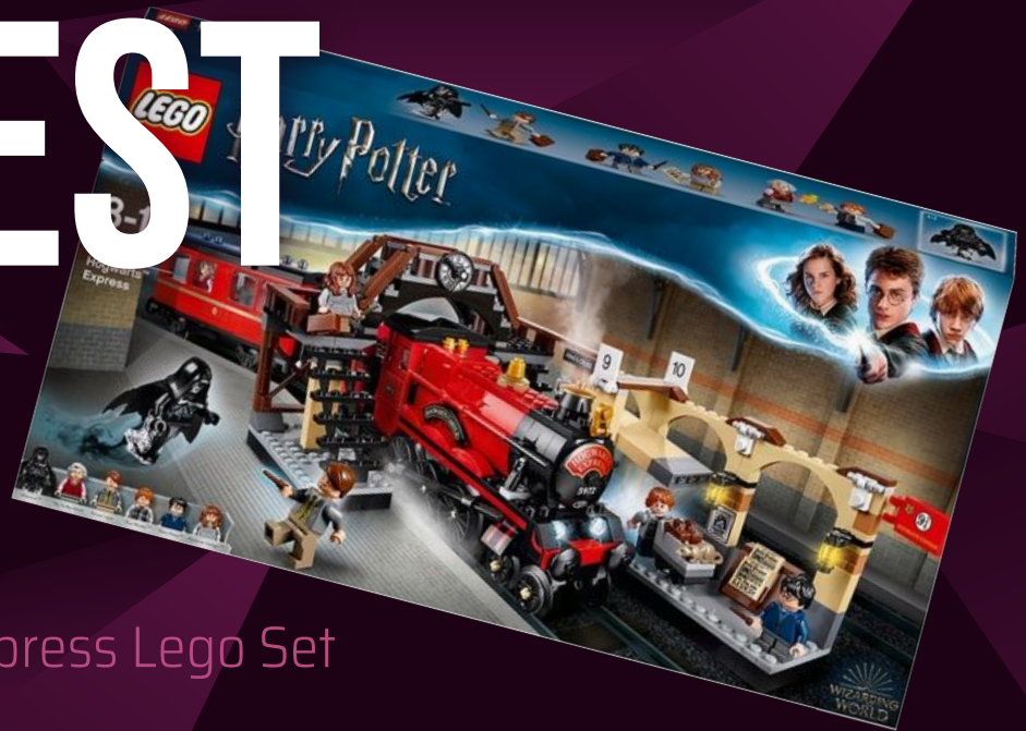
Harry Potter Hogwarts Express Lego Set