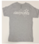
Youth & Adult T-Shirt

*** ONLY SELECT ITEMS PICTURED BELOW, MORE OPTIONS AVAILABLE ON FORM ***