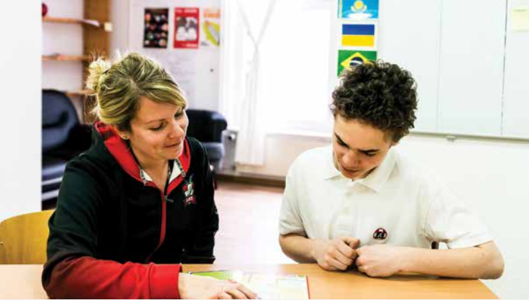
Middle School Grades 7 & 8