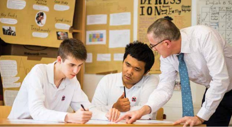
US High School Diploma Grades 11 & 12