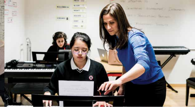
International Baccalaureate Grades 11 & 12

In order to provide our Middle School students with a strong scholastic foundation and skill set, our programming for grades 7 and 8 is divided into two segments—Academic Core and Academic Exploration. We also offer English Language Acquisition studies.