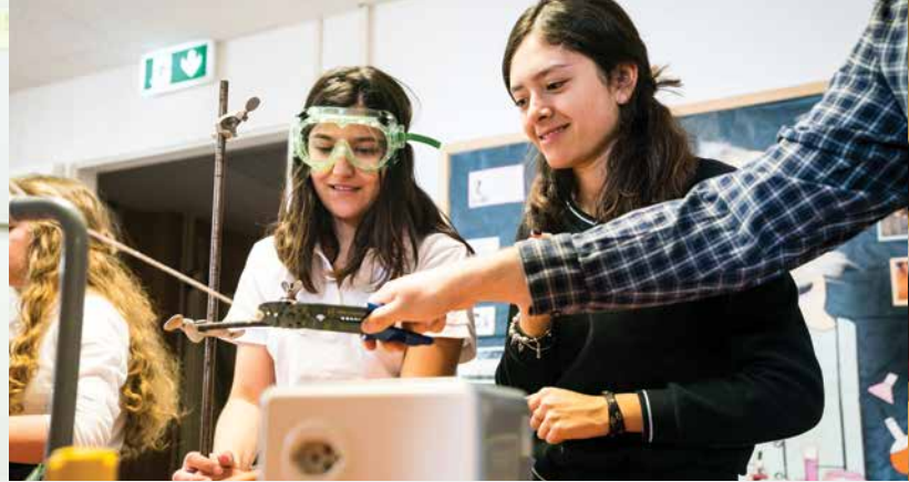
Preparatory Years Grades 9 & 10