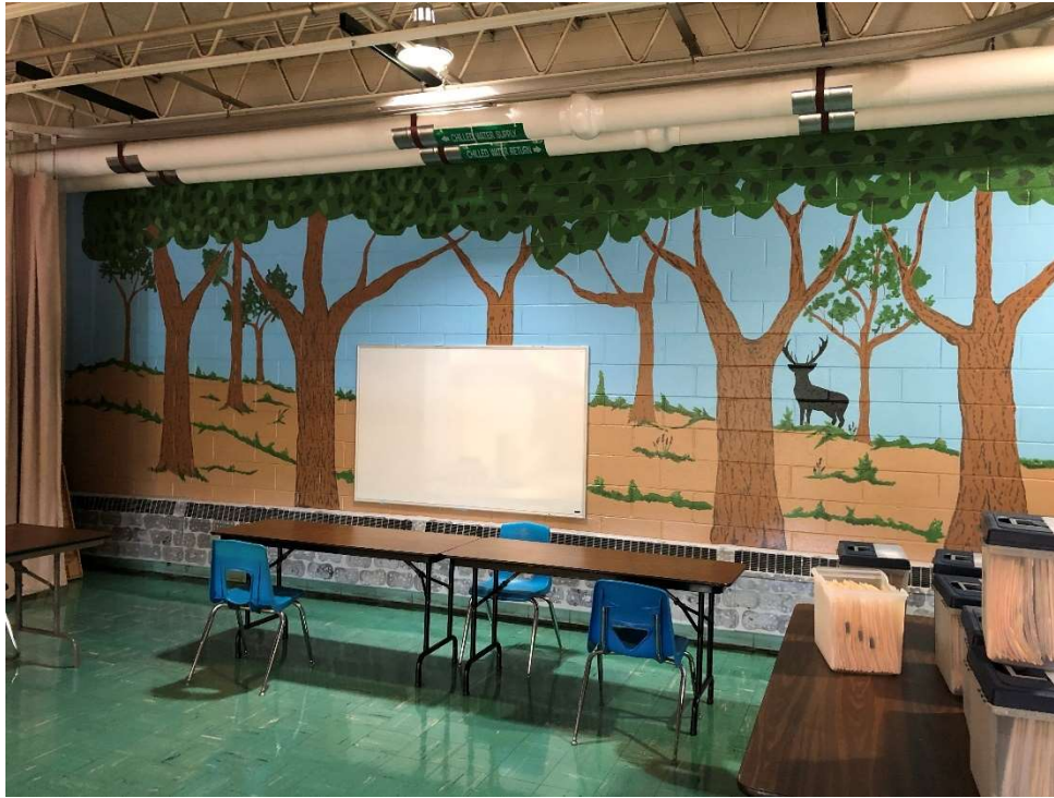
Mural on MPR stage