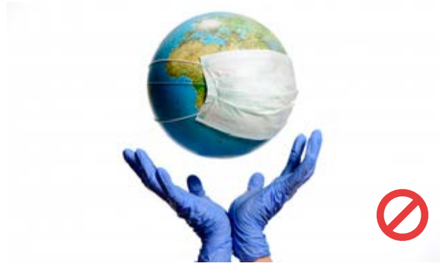
Use google/stock images