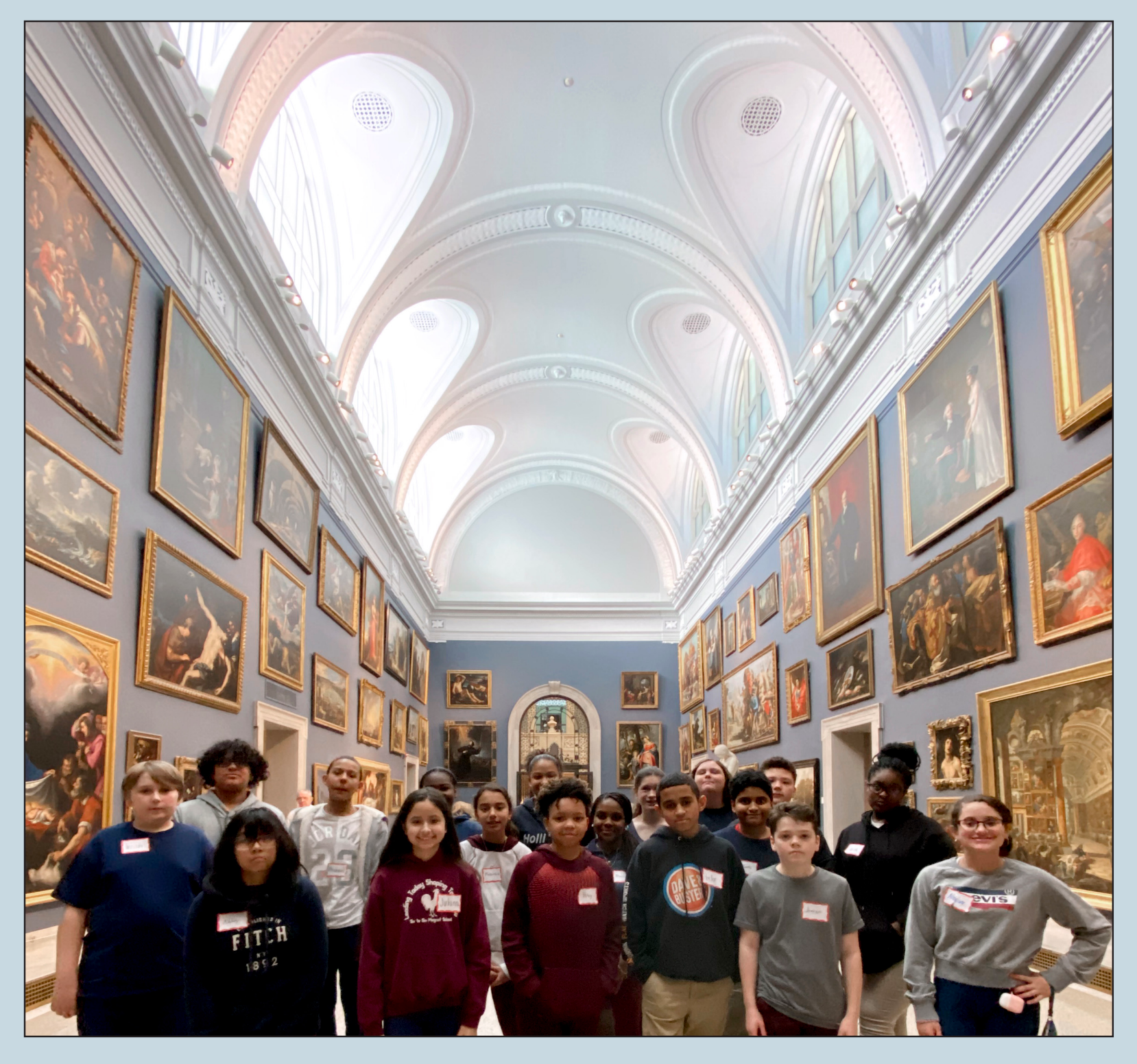
THE C.E.S. FOUNDATION was created in 2007 with the mission of enhancing learning opportunities for students of C.E.S. educational programs. In January 2020, the Foundation provided funds to cover transportation costs when a group of Six to Six Magnet School seventh-graders visited the Wadsworth Atheneum Museum of Art in Hartford.