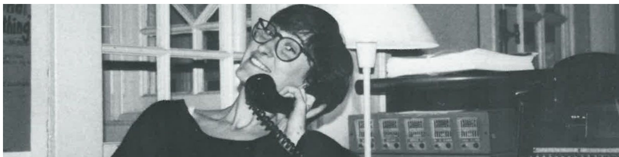
A student chats on the phone while working at the Bell Desk.