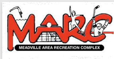
MEADVILLE AREA RECREATION COMPLEX