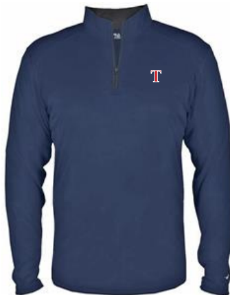
1/4 Zip Sport Pullover $45

Available in red, navy, grey youth sizes S-XL adult sizes S-2XL