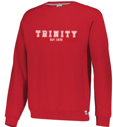
Crew Neck Sweatshirt $25

Available in red, navy, grey youth sizes XS-XL adult sizes XS-2XL