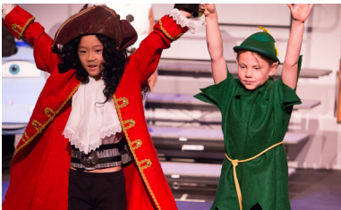
Third Grade - Once Upon a Time

Great Pumpkin Day and The Holiday Program