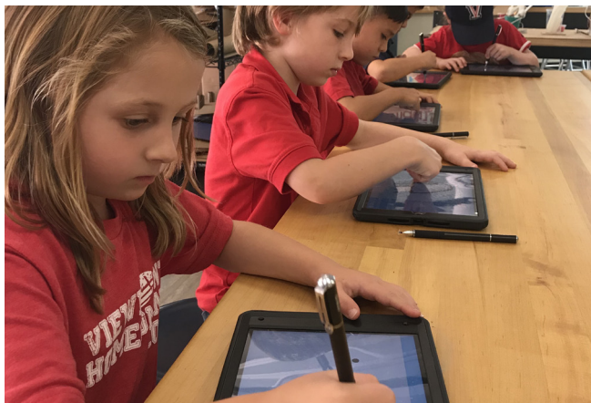
iPad integration with Kindergarten