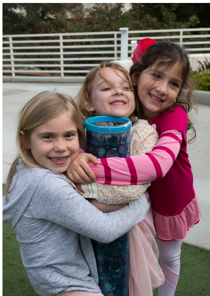
Primary School Pennies for a Purpose