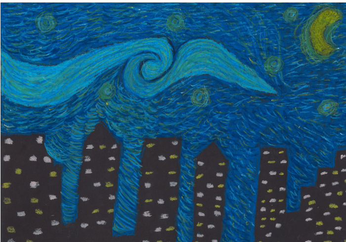
Examples of Lower School Art