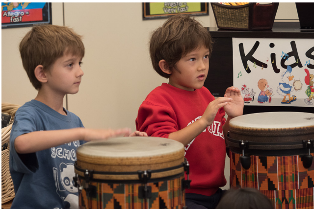
Music Time in the Primary School