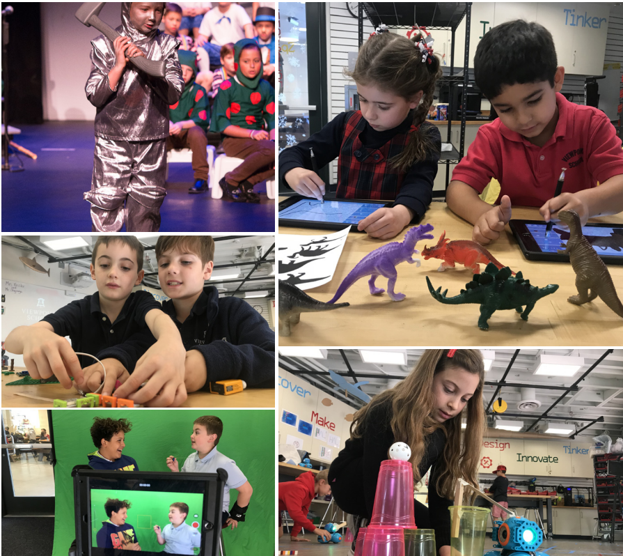
Kindergarten through Fifth Grade Innovation Space

Our collection of more than 10,000 books is diverse, current, and carefully curated to enhance our children's reading enjoyment. The library is designed to maximize each student's reading and research experience, with casual seating areas and workspaces in a technologically rich environment.