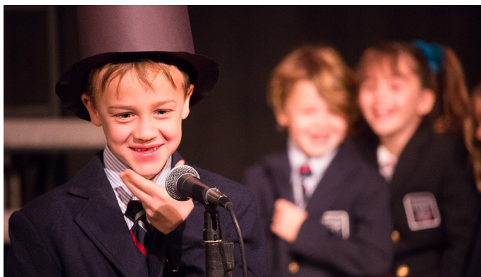
First Grade hosting an Assembly

In addition, classes responsible for hosting and contributing prepare with their teachers to share skits, songs, dances, poetry, or inspirational readings, all incorporated within the theme of each particular assembly. The youngest children quickly become comfortable speaking and making presentations to an audience of their peers, teachers, and parents. This presence on stage builds confidence in even our youngest students. In addition, students learn the protocol and value of being an engaged audience and show appreciation for the performers' hard work and preparation. As a sign of respect for these important community events, students wear assembly-dress uniforms.