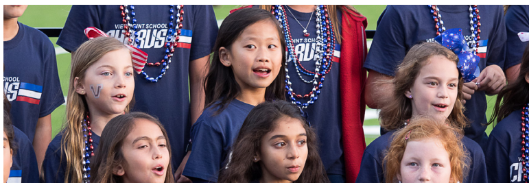
Lower School Chorus performing at the Homecoming Game