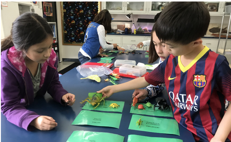
Lower School Science