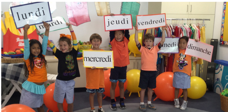
French in Primary School