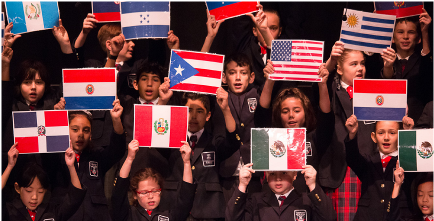
Lower School Spanish Performing in the World Language Assembly