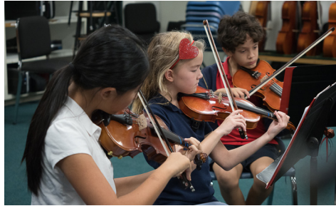
Primo Orchestra and Suzuki Strings