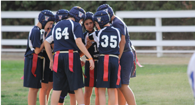
Lower School Flag Football