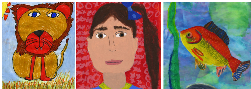
Examples of Primary School Art

Art instruction takes place in studio style classrooms specifically designed and equipped for our youngest children under the guidance of teachers who themselves are specialists in fine arts.