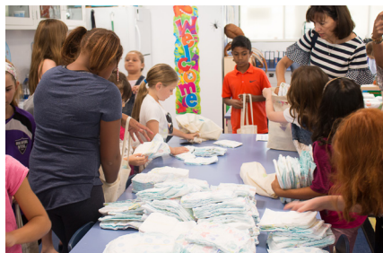
Baby2Baby - Hour of Giving

Fifth Graders complete a mathematics unit where they create their own businesses, conduct a campus sale over several days, and then collect their business proceeds to make a charitable contribution. As a whole, the class nominates and then votes on which charity should receive their businesses' collective profits. Fifth Grade classes annually present contributions of several thousand dollars to organizations that have included the American Cancer Society, Alzheimer's Association, Make a Wish Foundation, the Heart Fund, and City of Hope.