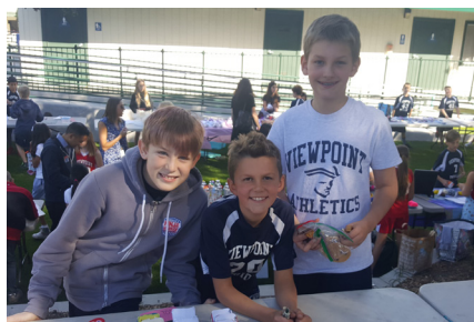
Fifth Grade Sales