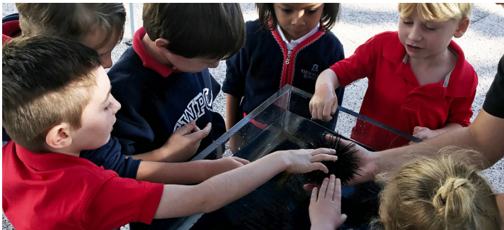
Cabrillo Science Visit to Primary and Lower School