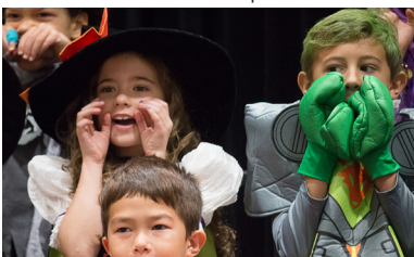
Kindergarten through Fifth Grade - Great Pumpkin Day