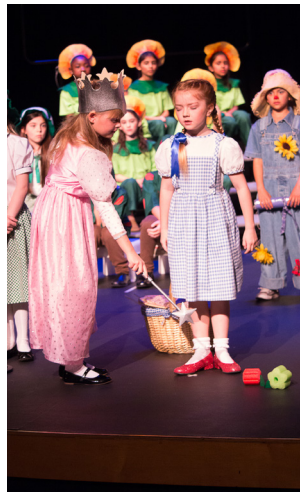
Second Grade - Wizard of Oz