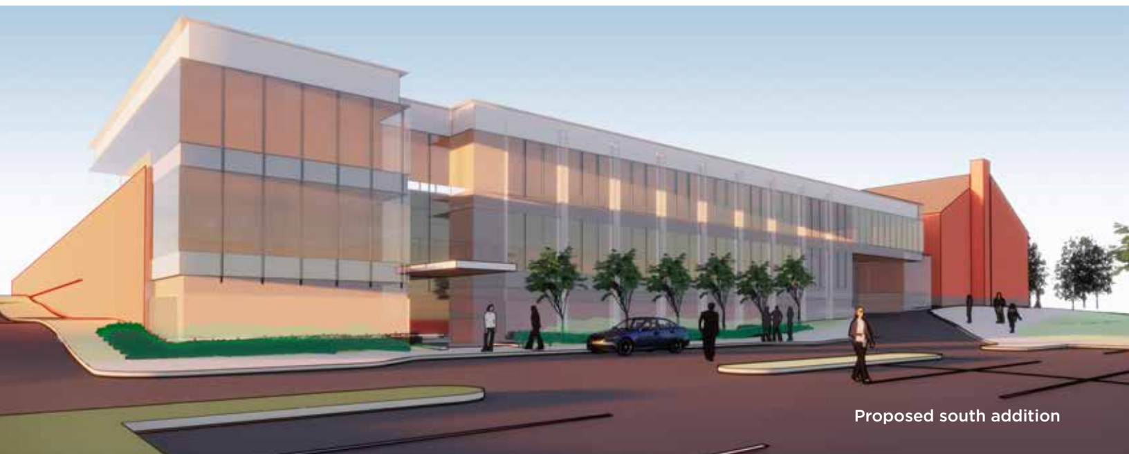
Proposed south addition