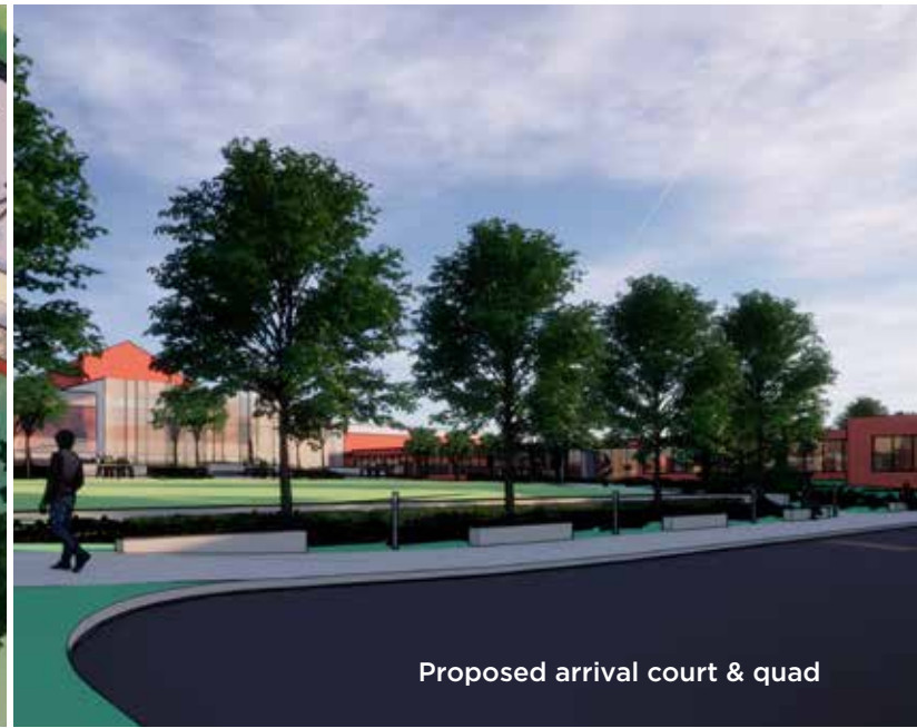
Proposed arrival court & quad