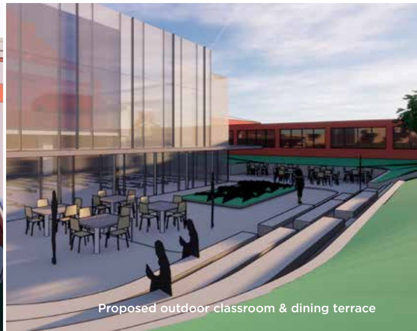
Proposed outdoor classroom & dining terrace