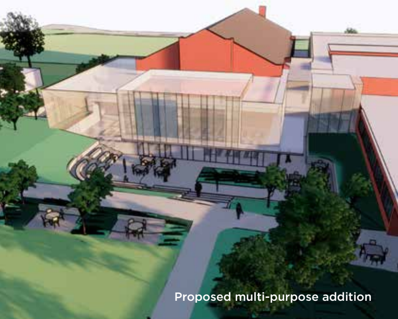
Proposed multi-purpose addition