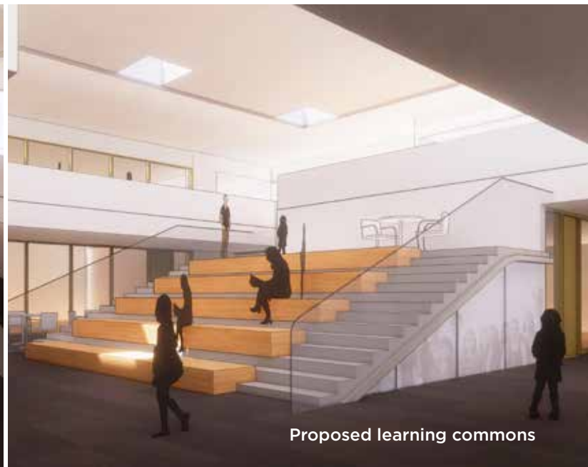
Proposed learning commons