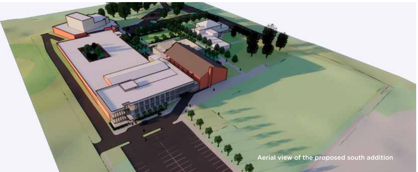
Aerial view of the proposed south addition