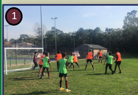
Madden VS Oxford