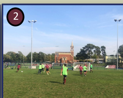
Keable VS Madden