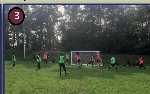
Madden VS Cambridge