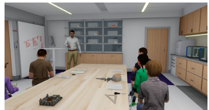
LS STEAM FACILITIES AND CLASSROOMS