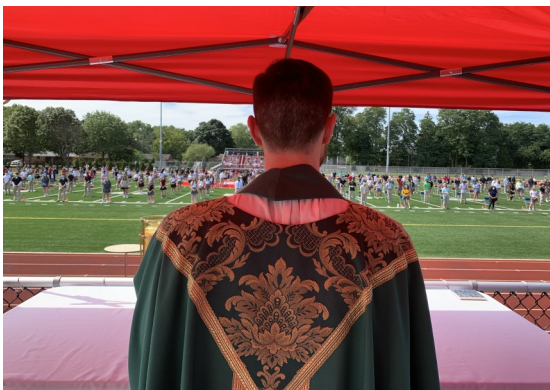
Mass on the athletic field with the high school kids.