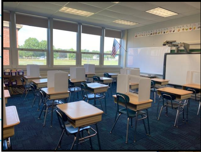
An example of a classroom

The hallways have a yellow line to divide it. There are arrows showing you which direction to walk. 12