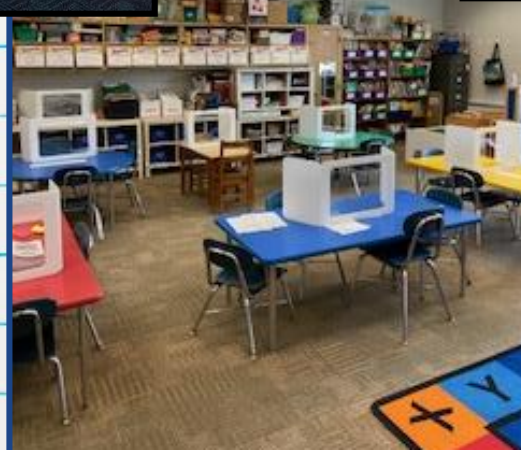
An example of a Kindergarten classroom