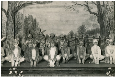
Production of Toad of Toad Hall, 1939