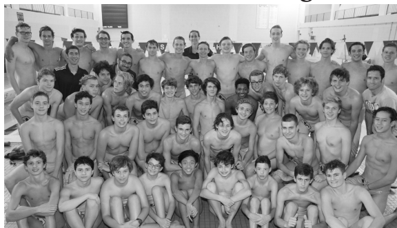
The swim team after practice last Friday.