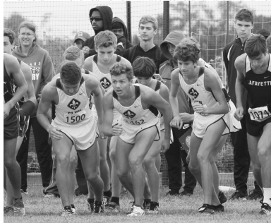
Cross Country prepares to start race

"It was really good, the weather was great. We were also fresh because we didn't have to stand around a lot