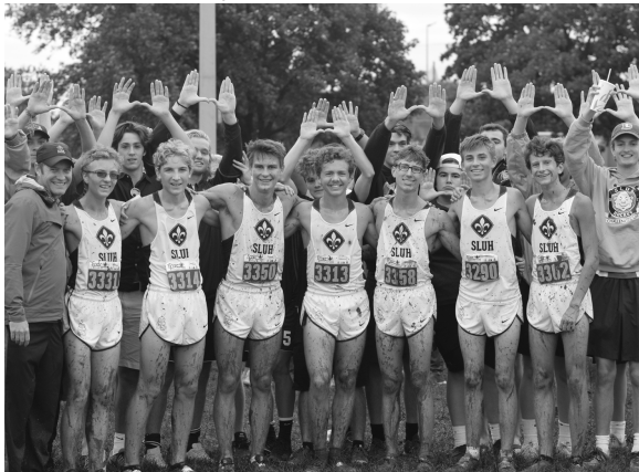
XC varsity after their second place finish.

Come raceday, the varsity finished second among the 23 teams racing in their division. They beat the number one ranked team in the state, Rock-