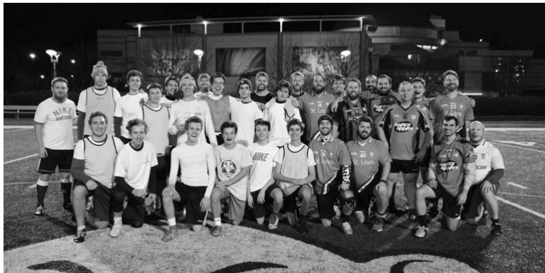
The SLUH Gaelic football team and the St. Louis Gaelic Athletic Club after their game on Wednesday.