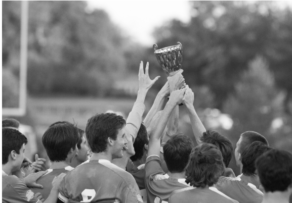
The soccer team with the CBC Tournament first place trophy.

The game started off with the same fast-paced offensive