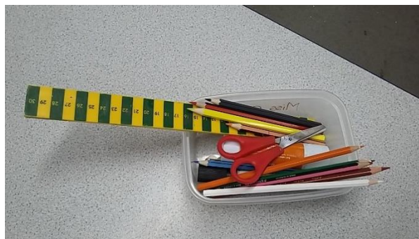
Year 1 Resource Pack

You will be given resources like pencils/pens/scissors/rulers/crayons that are just for you to use and not for sharing. Please place all stationary into your clear pencil case. Your teacher will decide what will go in your pack. This is to help keep you safe.