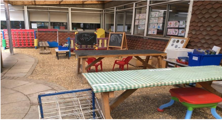
The outdoor classroom