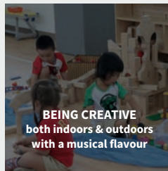
BEING CREATIVE both indoors & outdoors with a musical flavour