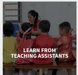
LEARN FROM TEACHING ASSISTANTS