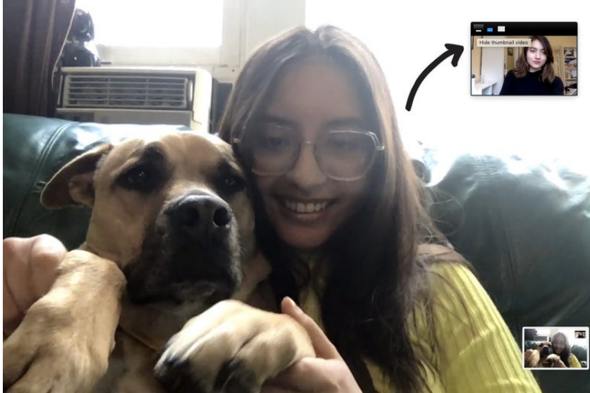
Speaker mode.

If you eventually happen to miss your own image—or if you just want to double-check that you’re not being captured at an unflattering angle, or that your pile of laundry isn’t in view—you can always right-click any user’s display and choose “Show Self View” in Gallery mode. In Speaker mode, you can return to the box indicating who’s speaking and click the middle icon in the menu.