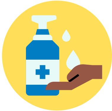
Clean hands before removing the mask