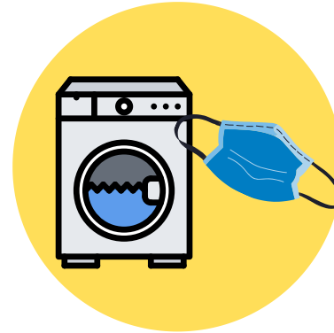
Wash the mask every day