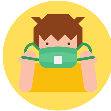
Remove the mask by the straps