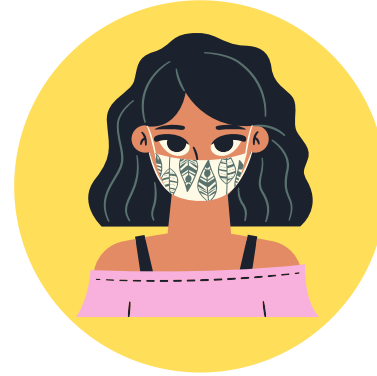
Cover your mouth, nose, and chin