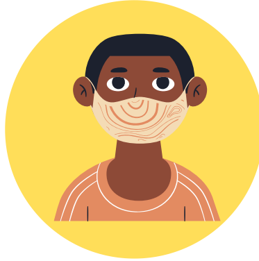
Adjust the mask without leaving gaps on the sides