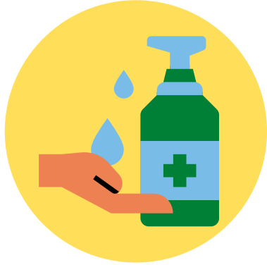
Clean hands before touching the mask