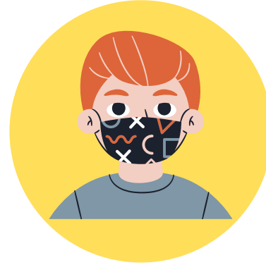
Avoid touching the mask