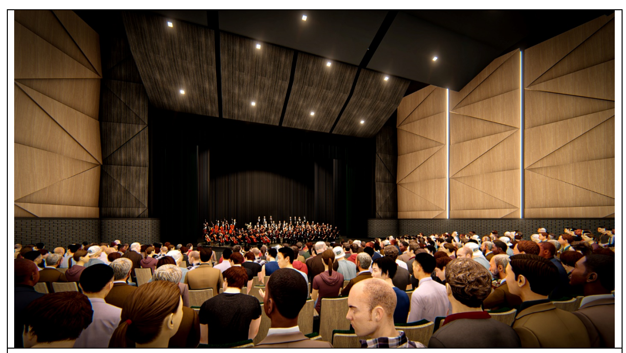
Schematic Design of Auditorium